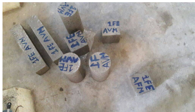
Fig.3 Concrete cubes after demoulding