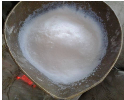
Fig.1 image of nano \text{SiO}_2 used