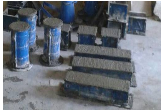
Fig.2 Concrete cubes casted in moulds

International Journal of Innovative Research in Science, Engineering and Technology An ISO 3297: 2007 Certified Organization Volume 7, Special Issue 5, April 2018 1 st International Conference on Recent Innovation in Civil Engineering and Management (ICRICEM '18) 22 nd March 2018 Organized by Department of Civil Engineering & MBA, Loyola Institute of Technology, Chennai, Tamilnadu, India